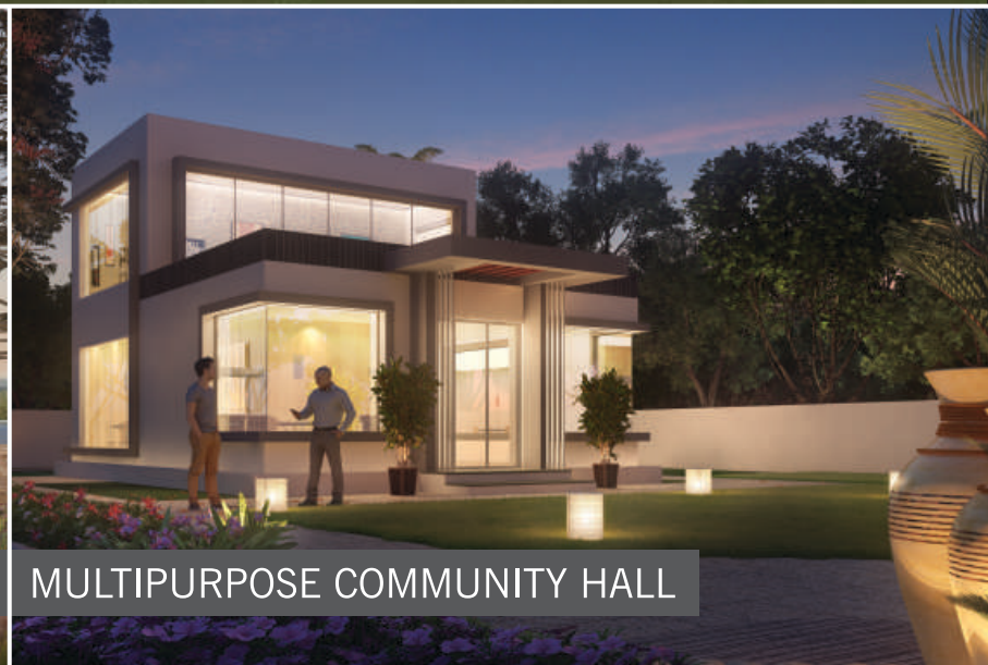
MULTIPURPOSE COMMUNITY HALL