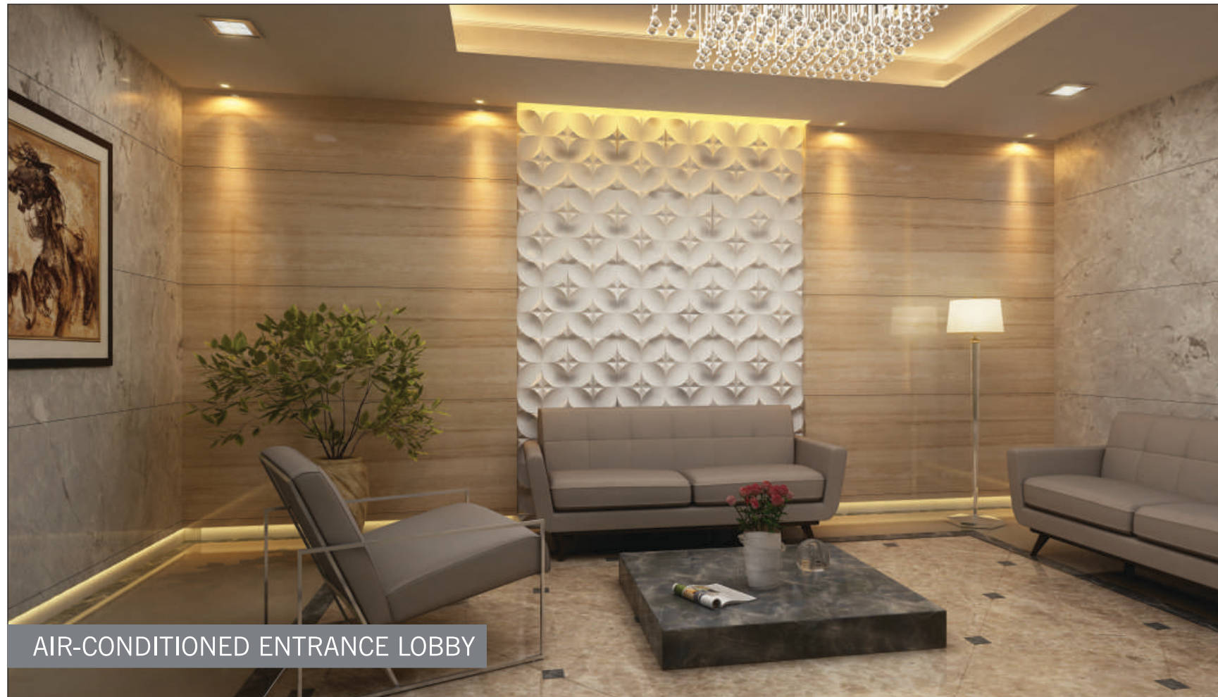
AIR-CONDITIONED ENTRANCE LOBBY