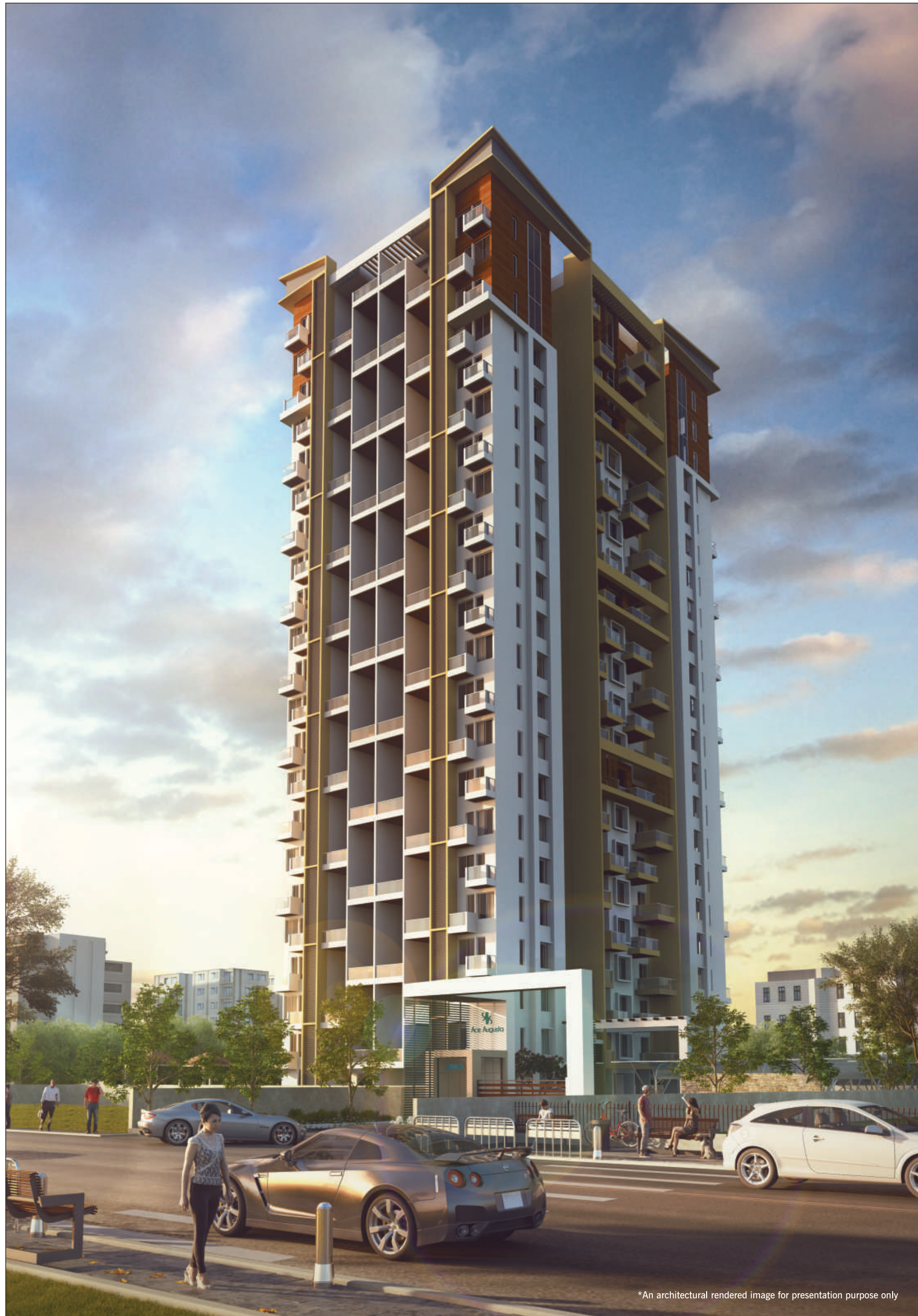
*An architectural rendered image for presentation purpose only

Bringing to you the most awaited premium apartments, an epitome of elegance and luxury for the select few. Every Ace Augusta residence has its own astute vision of life. This is fully supported by an array of unparalleled facilities allowing an experience of ease and distinction. JHAMTANI GROUP presents a premium residential address that creates a harmony of vibrance and elegance. These are abodes that are bound to make you marvel with their keenly planned aesthetics and the acute sense of splendour. The unmistakably visible charm not only becomes successful in creating an instant impression of opulence but also an irresistible, eternal charm.