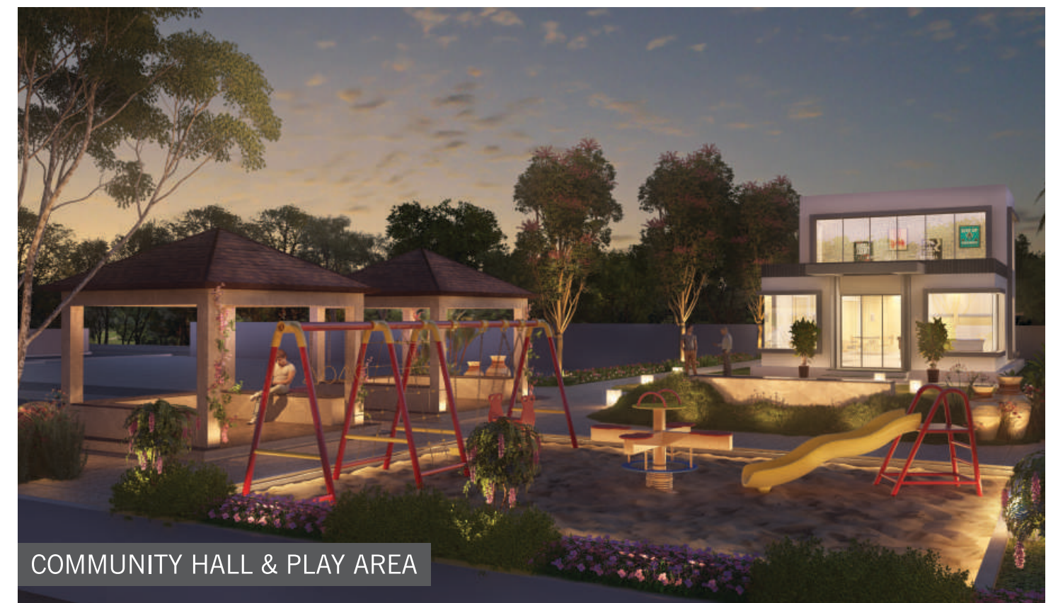
COMMUNITY HALL & PLAY AREA