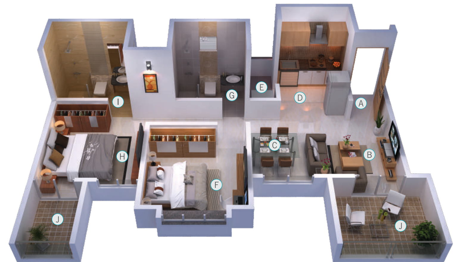
2 BHK TYPE 'B'